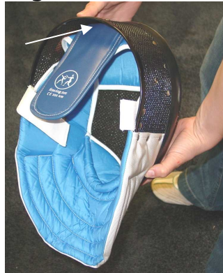
Tongue bent at rivet