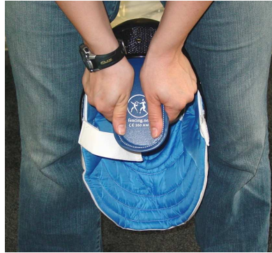
Step 2 – Front View